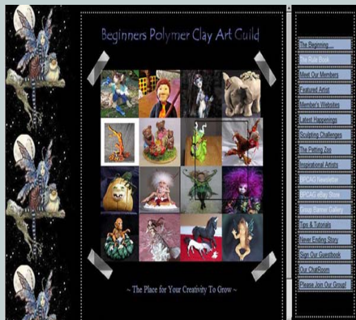
New Look to the Fairy Studio